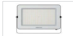
Toughened glass cover & SMD LED Design