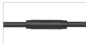
Water blocker avoid from input wire