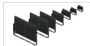
Full range series from 10 to 200W