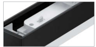
Switch color temperature